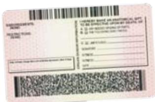
PDF417 barcode on a driver's license.