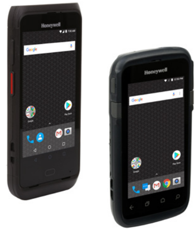
CT40 and CT60 Mobile Computers

Medical Courier Elite (MCE)* is a custom third-party specimen tracking and courier software application that offers a comprehensive cloud-based solution designed specifically for medical lab specimen tracking and courier route management utilizing barcodes and GPS. MCE optimizes the