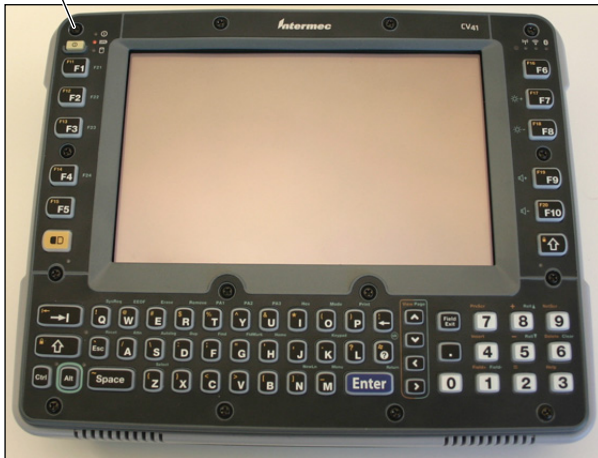
Screw (14 places)