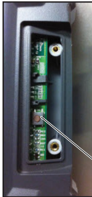
UPS Battery Disconnect button