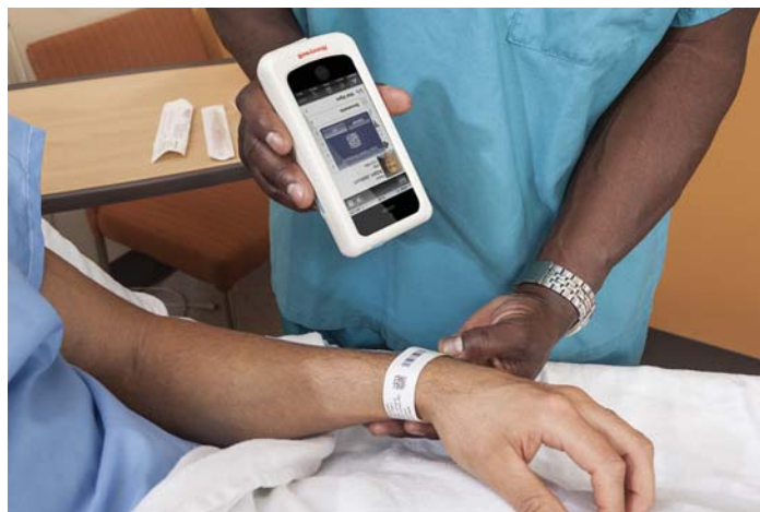
Using a converged device to scan patient wristbands

Consider that in many hospitals, simply asking a question of another staff member and receiving an answer may require a combination of walking the floor to search for a colleague, calls and call-backs, and overhead paging. According to a study by the Wood Johnson Foundation 1 , nurses waste as much as 60 minutes of each day tracking