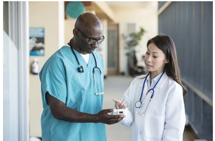
Tablets and smartphones for EMR access

For organizations that have deployed or are planning to deploy Apple