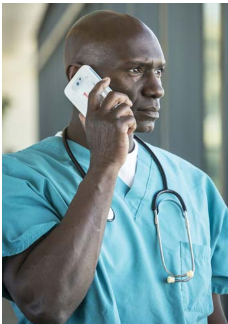
Voice calls between care team members

Regardless of whether the facility deploys a purpose-built device or iPhones equipped with scanning sleds, the benefits of deploying one mobile device that allows the nursing staff to interact with doctors, patients, other nurses, and a full suite of patient care and messaging applications can both improve patient care and staff efficiency, while simultaneously improving the overall work environment.