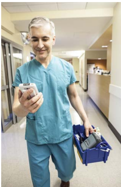
Mobile workflows are faster

These devices act as an adjunct or complement to existing workstation on wheels (WOWs) solutions, which would be used for heavier documentation activities that require a full keyboard. The combination of converged mobile devices, WOWs, and desktop systems can provide nurses and physicians with multiple entry points to the electronic medical record, offering the flexibility to use whichever device is most appropriate to the environment or situation.