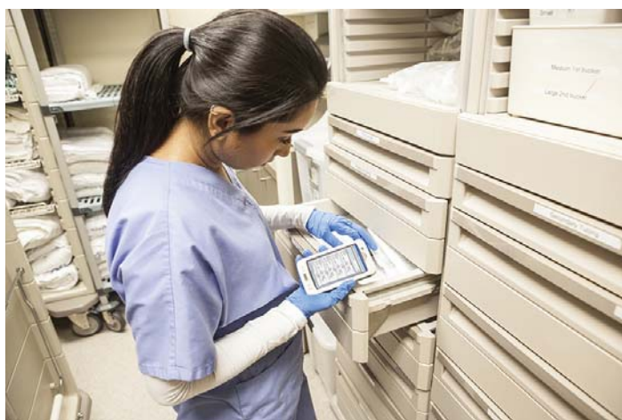
Converged device used in supplies management

management requirements, and their choice of mobile device management solution.