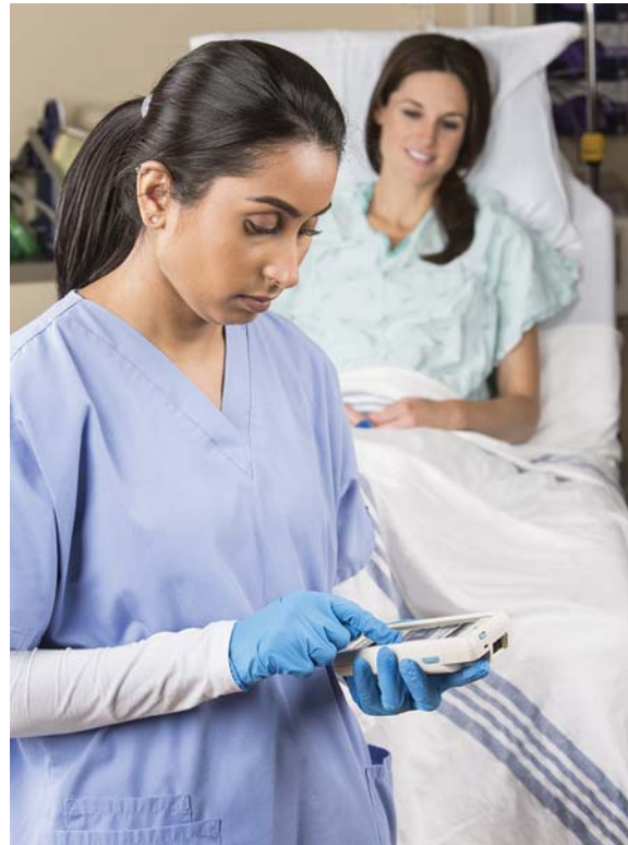
Texting the doctor from the bedside

Deploying mobile, flexible, and reliable IT tools to caregivers is a top priority for provider organizations that not only need to meet new regulatory and technology requirements, but want to do so efficiently. At Cedars-Sinai Hospital in California, for example, the combination of smartphones and a new software solution to help prioritize alarms resulted in faster response times for emergency conditions, and a 50 percent reduction in overhead pages. Laboratory values are received 10 minutes faster and nurses are able to spend more time at the bedsides of patients