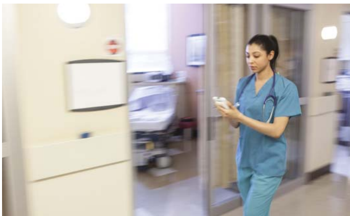
Smartphones allow faster response to telemetry alarms

The passage of the The Health Insurance Portability and Accountability Act (HIPAA), Health Information Technology for Economic and Clinical Health (HITECH) Act, and the Patient Protection and Affordable Care Act (PPACA, or ACA) have established new incentives to promote technology adoption, and created new regulations related to outcomes, patient safety, and documentation. In response, hospitals and other healthcare facilities have deployed a dizzying array of technology, from electronic medical record (EMR) systems and networked medical monitoring devices, to bar code scanners for medication administration at the bedside and hospital-provided mobile phones to improve team communication. While these efforts have provided improvements in patient safety and